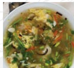
Manchurian Soup (Chicken & Shrimp)