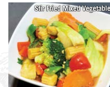
Stir Fried Mixed Vegetables