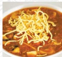
Manchow Soup (Chicken & Shrimp)