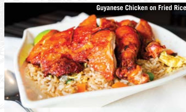
Guyanese Chicken on Fried Rice

IMAGES ON THE MENU ARE FOR ILLUSTRATION ONLY. NOTE THAT RECIPES ARE SUBJECT TO CHANGE WITHOUT NOTICE WHEN CERTAIN INGREDIENTS ARE UNAVAILABLE DUE TO MARKET OR SEASONAL CONDITIONS.