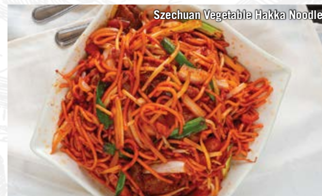
Szechuan Vegetable Hakka Noodle