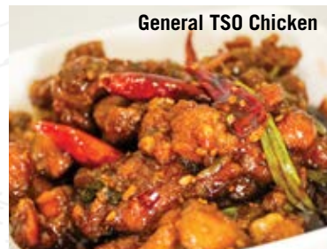
General TSO Chicken