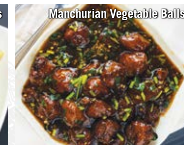
Manchurian Vegetable Balls