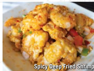
Spicy Deep Fried Shrimp