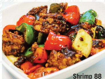
STEAM RICE IS NOT INCLUDED WITH DINNER ENTRÉE.