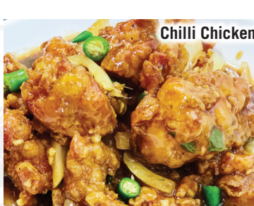
STEAM RICE IS NOT INCLUDED WITH DINNER ENTRÉE.