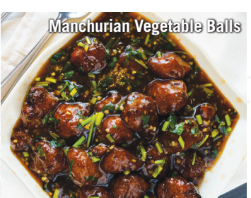
STEAM RICE IS NOT INCLUDED WITH DINNER ENTRÉE.