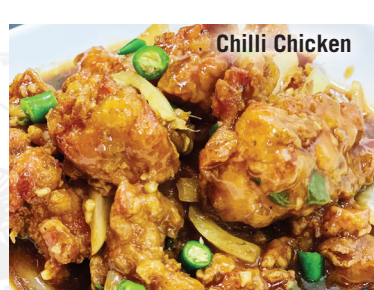
STEAM RICE IS NOT INCLUDED WITH DINNER ENTRÉE.