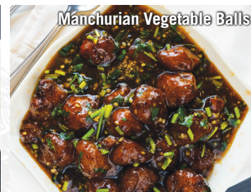
STEAM RICE IS NOT INCLUDED WITH DINNER ENTRÉE.