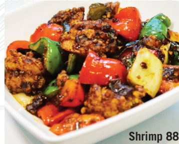
STEAM RICE IS NOT INCLUDED WITH DINNER ENTRÉE.